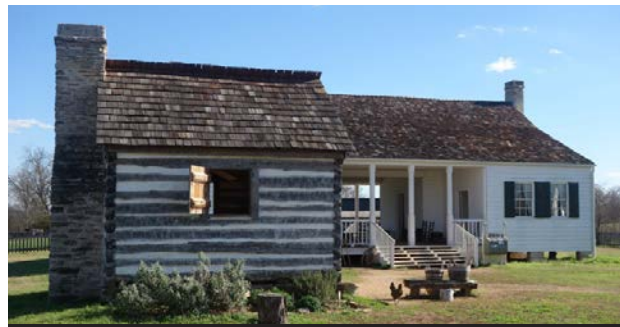
WASHINGTON ON THE BRAZOS, WASHINGTON

Founded in 1907, Blue Bell grew from a small Texas dairy into the third-largest ice cream producer in the U.S. today. Join more than 100,000 annual visitors on a tour of the factory, savor fresh hand-dipped ice cream in the parlor and shop for factory memorabilia in the Blue Bell Country Store.