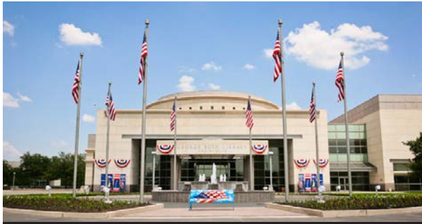
GEORGE BUSH PRESIDENTIAL LIBRARY AND MUSEUM

The Bush Library and Museum reveals the unique influences and challenges of George H.W. Bush's life and presidency, encompassing much of the nation's history since 1941. Experience this special museum through artifacts, film, photographs, documents, music, sound and interactive technology.