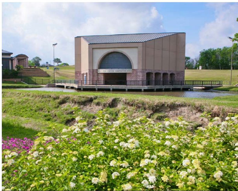
WOLF PEN CREEK, COLLEGE STATION