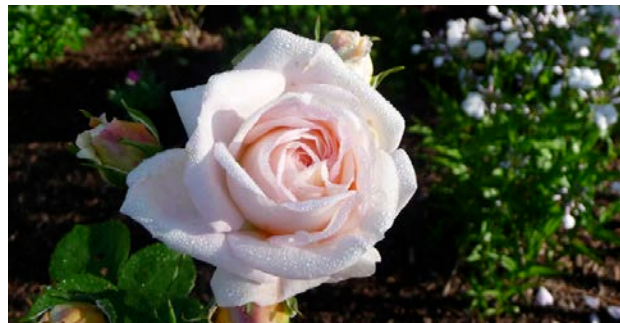
ANTIQUE ROSE EMPORIUM, BRENHAM

The family owned-and-operated Royalty Pecan Farms offers fresh Texas pecans, pecan candies, breads, pies, and other handmade treats for visitors. Its gift shop sits on a bluff overlooking 500 acres of lush pecan trees. Bring friends and family for a day of shopping, sampling, wine tasting, and more!