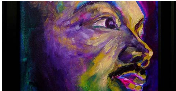
BRAZOS VALLEY MUSEUM OF NATURAL HISTORY