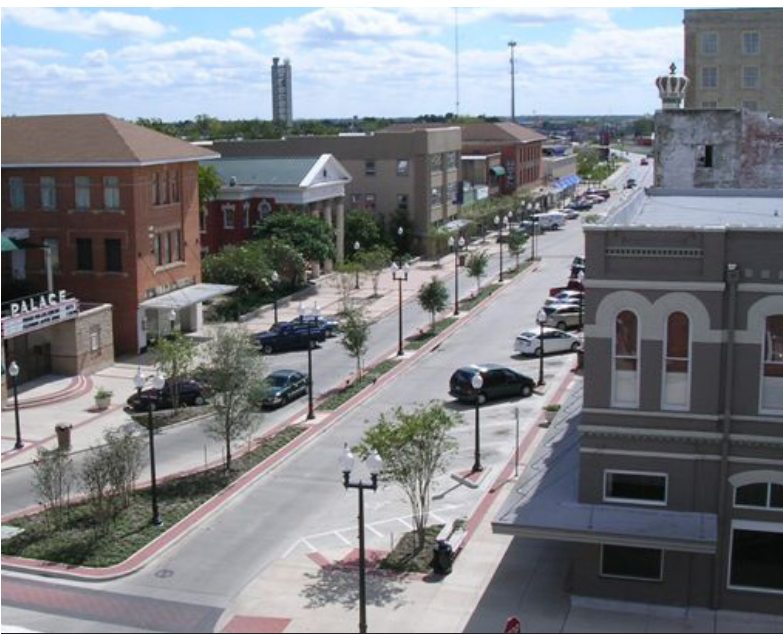
HISTORIC DOWNTOWN, BRYAN