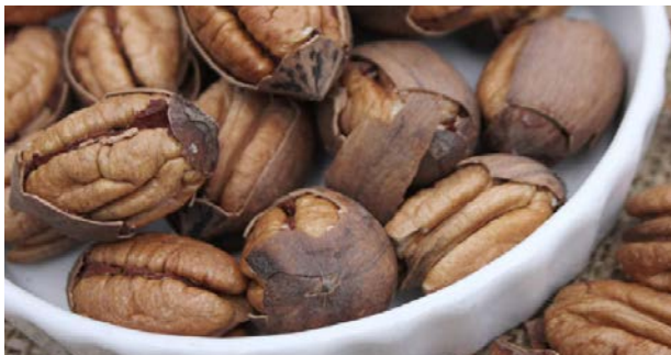
ROYALTY PECAN FARMS, CALDWELL

This picturesque site located along the Brazos River provides a beautiful setting for picnicking, sightseeing and bird watching. You can also learn about those who fought and won Texas' independence from Mexico at The Star of the Republic Museum, Independence Hall and Barrington Living History Farm.