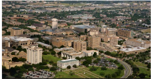
TEXAS A&M UNIVERSITY

The Bush Library and Museum reveals the unique influences and challenges of George H.W. Bush's life and presidency, encompassing much of the nation's history since 1941. Experience this special museum through artifacts, film, photographs, documents, music, sound and interactive technology.