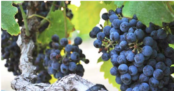
MESSINA HOF WINERY AND RESORT®

Lake Bryan is a power plant cooling reservoir located 5 miles northwest of Bryan. The lake is a popular destination for boating, fishing, biking and camping. Visitors can also enjoy a casual dinner at the Lakeside Icehouse or come out with friends after a day on the water to enjoy live music and an incredible sunset.