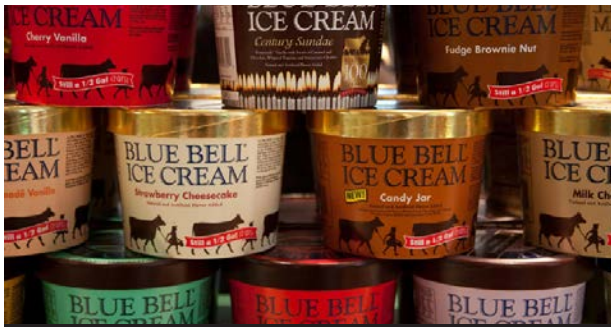
BLUE BELL CREAMERY, BRENHAM

Founded in 1907, Blue Bell grew from a small Texas dairy into the third-largest ice cream producer in the U.S. today. Join more than 100,000 annual visitors on a tour of the factory, savor fresh hand-dipped ice cream in the parlor and shop for factory memorabilia in the Blue Bell Country Store.